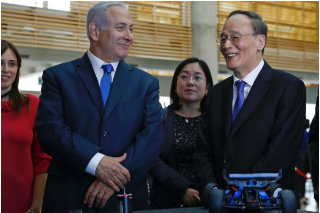
Chinese Vice Chair Wang Qishan during his tour with Israeli Prime Minister Benjamin Netanyahu of the Israeli Innovation Summit in Jerusalem on Oct. 24, 2018.

Why is Israel interested in China? Again, according to RAND, this interest stems from the Israeli government's desire to "expand its diplomatic and economic ties with the world's fastest growing major economy." Israel's leaders wish to diversify the country's "export markets and investments," even though China firmly supports Iran , a country that would love nothing more than to see Israel wiped off the face of the planet .